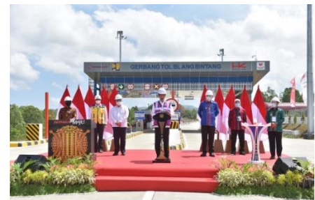
Inauguration of Aceh – Sigli Toll Road Section 4 – 25 August 2020